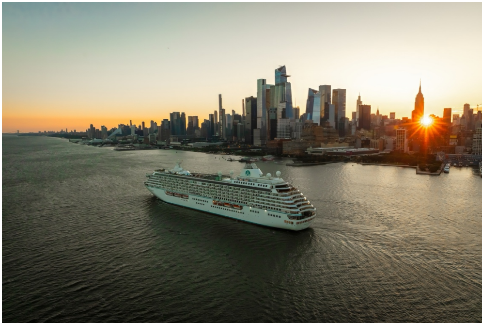
CRYSTAL SERENITY IN NYC

“I am beyond thrilled to return this October for another unforgettable journey, sharing my music and connecting with everyone once again.”